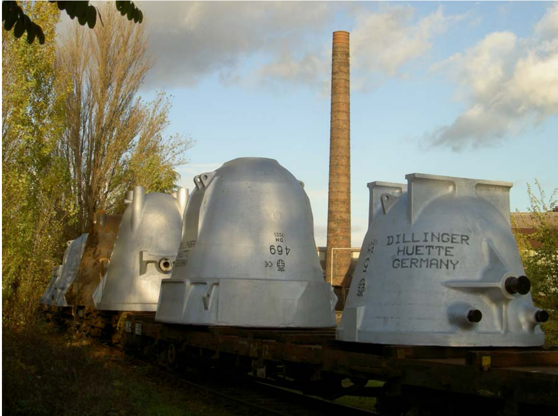
Slag pots ready for shipment at DILLINGER HÜTTE

DILLINGER HÜTTE is a modern industrial German group specialized in the producing of heavy plates in low-alloyed carbon steel grades. Organised as full integrated works, the major production facilities include cokery plant, blast-furnaces, oxygen steel plant - equipped with BOF-converters, secondary metallurgy, vacuum degassing, continuous and ingots casting - and plate mills.